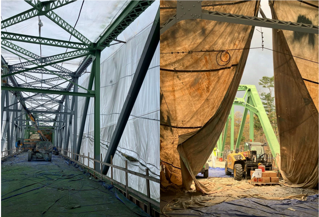
Span 1 painting