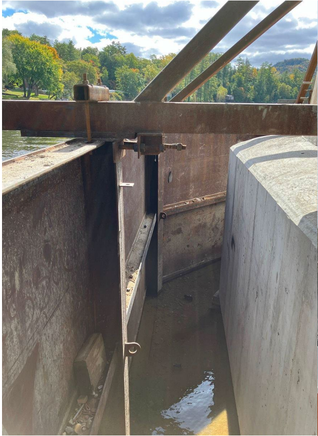
Look at the cofferdam